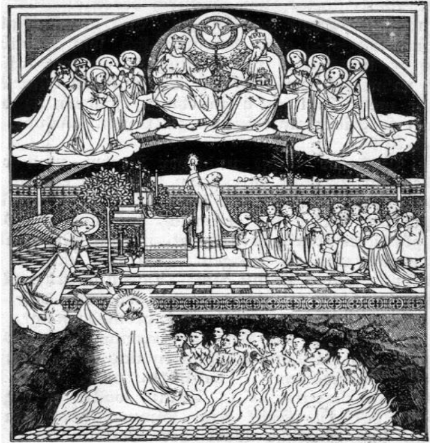
For the faithful departed

During the month of November, all Masses are for the faithful deceased. On the altar, there is a wooden box from Jerusalem with the red candle, it contains the names of deceased family and friends listed on the All Soul envelopes. When the priest offers any Masses during the month of November, these intentions will be remembered as the List of the Deceased.