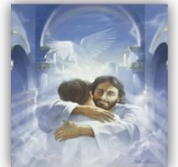
'Well done, good and faithful servant!'

There is no portion of our time that is our time, and the rest God's; there is no portion of money that is our money, and the rest God's money. It is all His; He made it all, gives it all, and He has simply trusted it to us for His service. A servant has two purses the master's and his own. But we have only one.