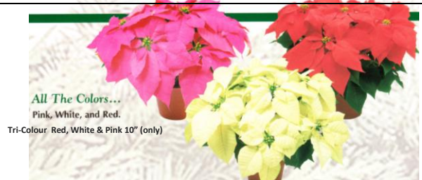
All The Colors... Pink, White, and Red. Tri-Colour Red, White & Pink 10" (only)

The 'WYD Group' is selling beautiful Poinsettia's Order forms are available in the vestibule. Prices are very reasonable: 6" $8.50 8" $16. 10" $30.